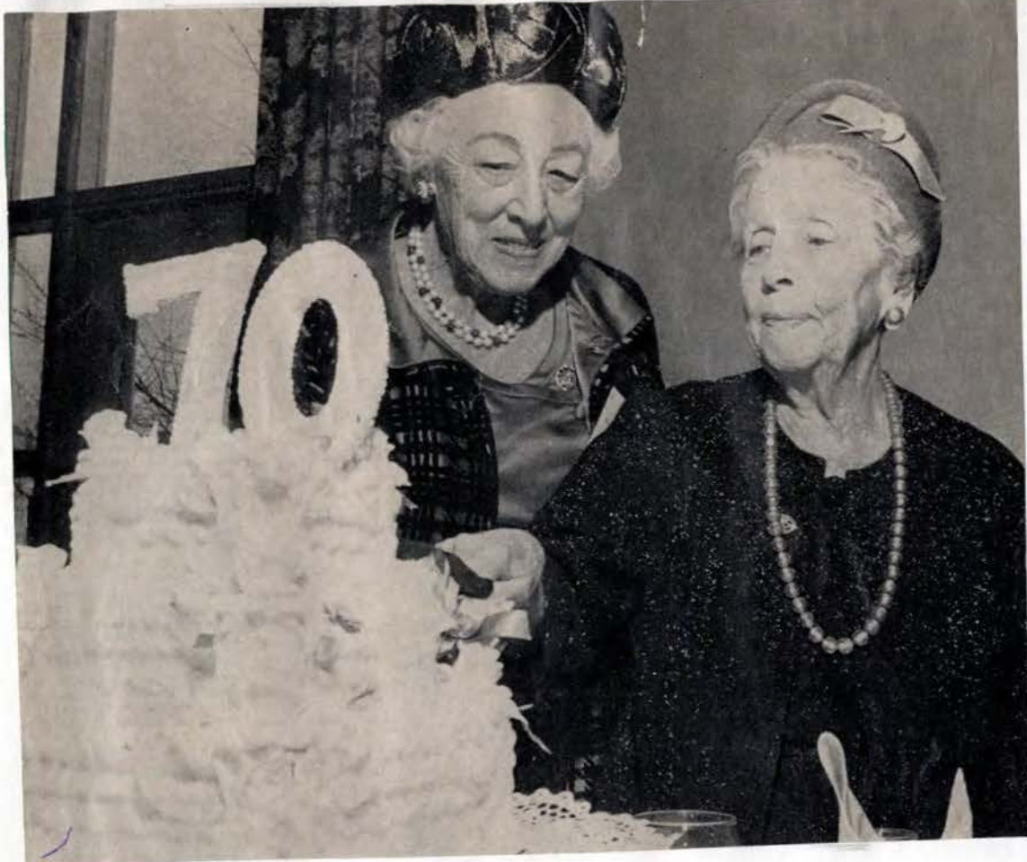
70 Birthday cake 1967