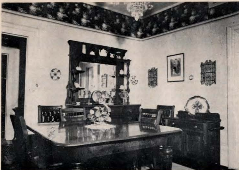
The interior of the Erland Lee Homestead showing the famous walnut table on which the first Constitution of the Women's Institute was written.